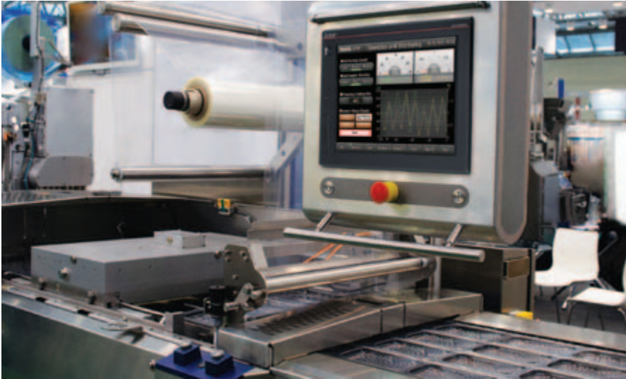
GOT2000 improves transparency and productivity in your production