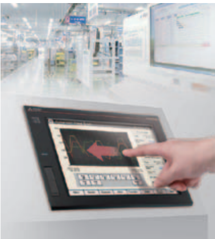
Multi-touch and gestures for easy operation