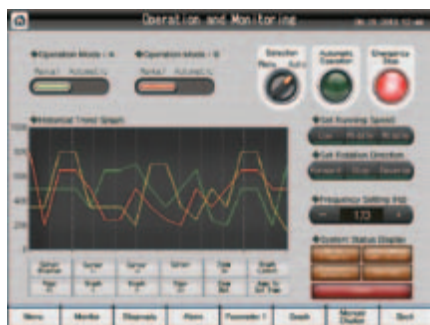
Reusable sample projects

GOT2000 HMIs provide 65536 colours, and support a wide range of image formats – including PNG – for clear screens with well defined objects that are crisp even when enlarged or reduced. The HMI also supports a library of outline fonts in different sizes.