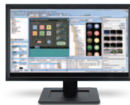
GT Works3 displays your screen assets

Providing an advanced solution for today’s monitoring and visualisation requirements, the GOT2000 HMIs provide significant improvements on the GOT1000 models that they replace, while ensuring backwards compatibility: panel sizes remain identical whilst existing projects can be easily ported to the HMIs.